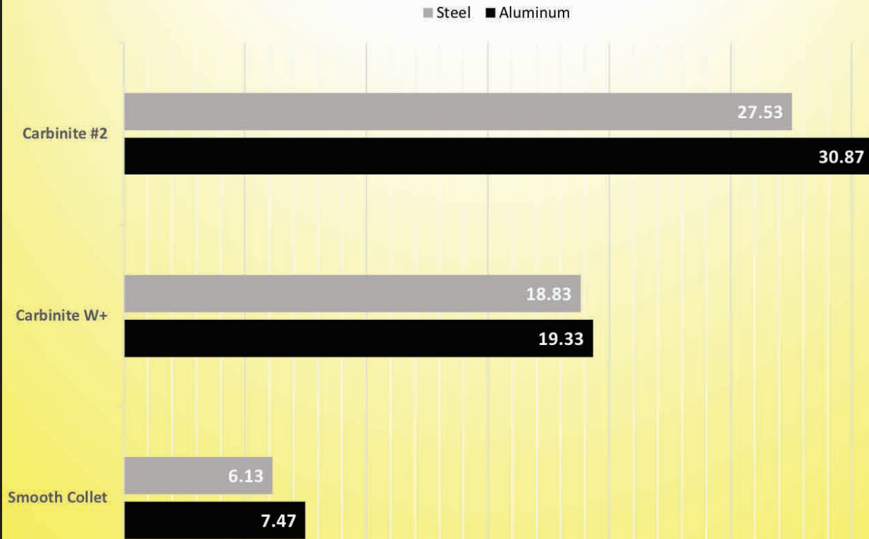
Moderate Test - 110 psi Draw Bar Pressure